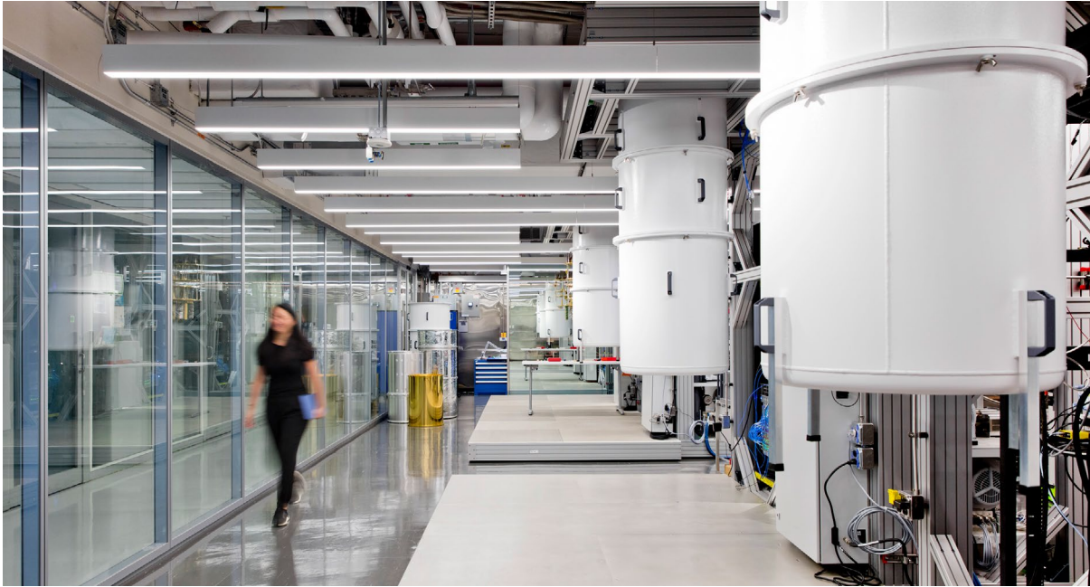
IBM Quantum Lab.

Western governments believe it is urgent to make headway in post-quantum cryptography. Indeed, some of the risks to network security that quantum networks may pose are actively being tackled by the U.S. Department of Commerce's National Institute of Standards and Technology. The booming field of post-quantum cryptography has attracted a steady stream of funding and has already delivered novel encryption systems that will hold up even against powerful quantum machines. 20