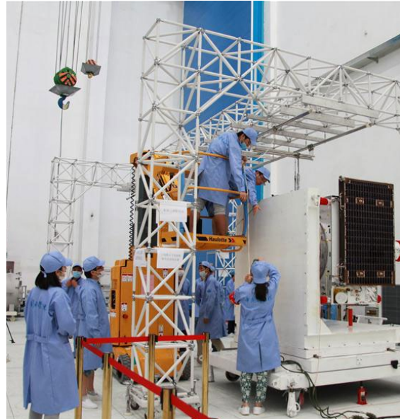
Solar wing deployment testing for quantum satellite Micius .

A sophisticated Chinese quantum communication system supports China's purported " Harvest Now, Decrypt Later " strategy, which siphons off large volumes of Internet traffic in the hope that it can be deciphered in the near future. 10 With other state actors assumed to be following suit, concern is growing about the fallout of an adversary being able to decode government and private sector communications.